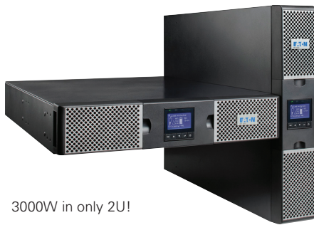
3000W in only 2U!