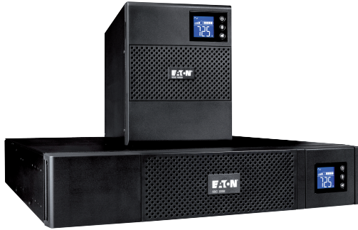
5SC is available in convenient compact form factors