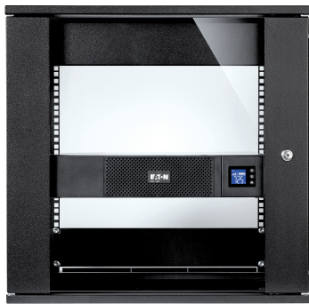
Short depth format for easy integration in small cabinets