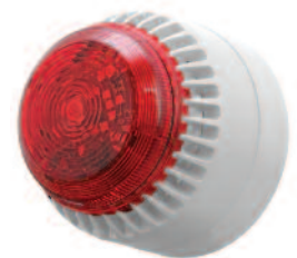
RoLP Solista White