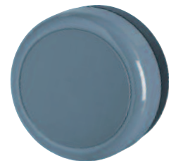
FB Bell Grey