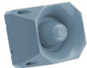
Asserta Maxi Grey