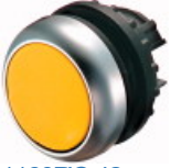
• 1160PIC-42 Photo Pushbutton actuator, flat