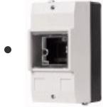
Photo Insulated enclosure for PKZM