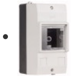
Photo Insulated enclosure for PKZM