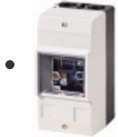
Photo Insulated enclosure for PKZM