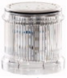
• 1160PIC-1309 Photo