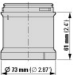
• 1160DIM-86 Line drawing