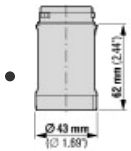
1160DIM-61 Line drawing