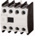
277951 DILM 150-XHI13