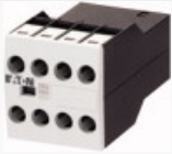
277377 DILM 32-XHI2