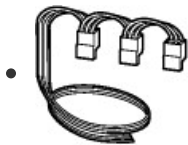
2100DRW-474 Line drawing