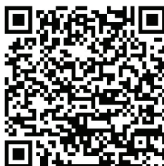
Scan for latest Declaration of Conformity

Scan the QR code to verify authenticity and current version of this Declaration