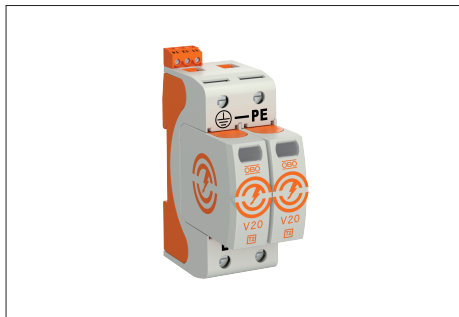
Surge arrester, type 2