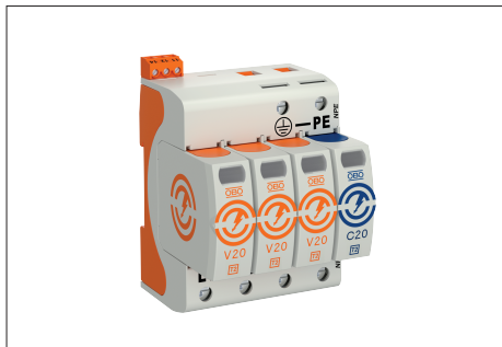
Surge arrester, type 2