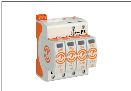
Surge arrester, type 2