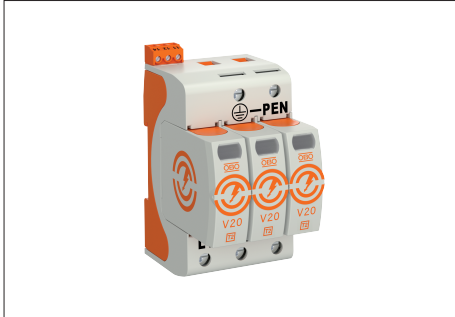
Surge arrester, type 2