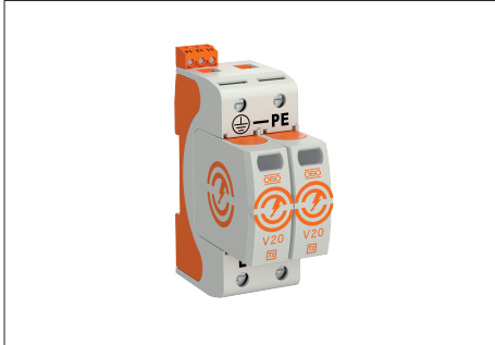
Surge arrester, type 2