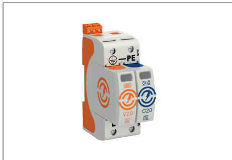
Surge arrester, type 2