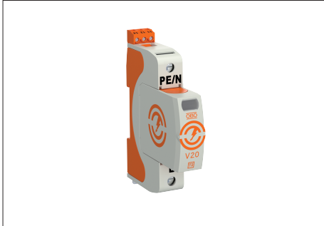
Surge arrester, type 2