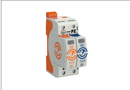
Surge arrester, type 2