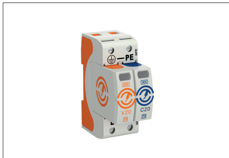
Surge arrester, type 2