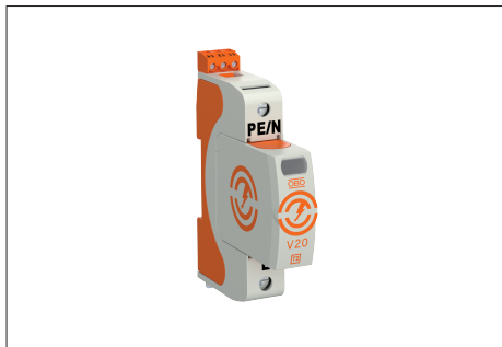
Surge arrester, type 2