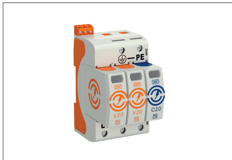
Surge arrester, type 2