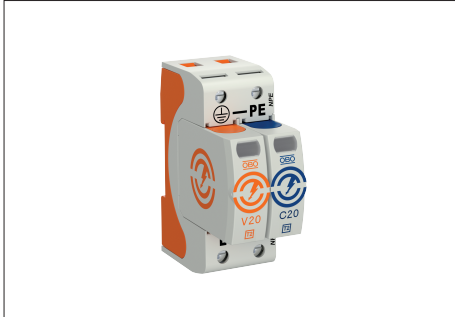
Surge arrester, type 2