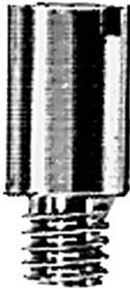
TEST SOCKET 2.3MM