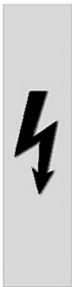
COVER W. LIGHTNING SYMBOL FOR TERMINALS SZ 4 AND 6