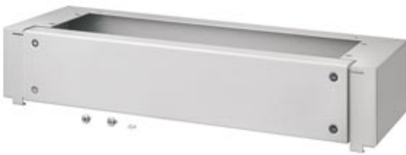
Similar to image

ALPHA 630 DIN, BASE FRAME, H=100 W=1050 D=210