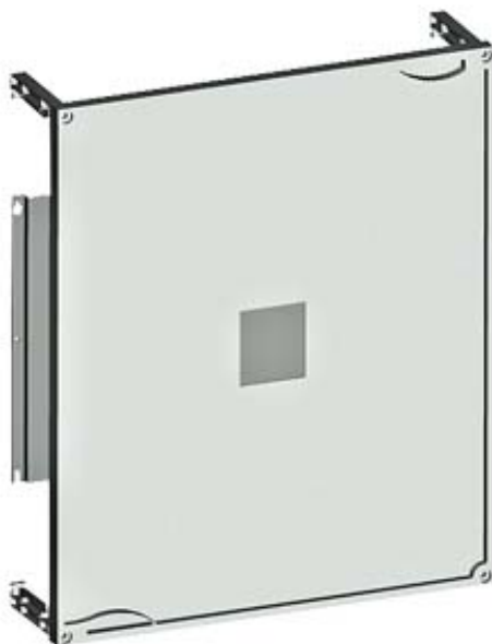
ALPHA 1600 DIN ASSEMBLY KIT F.3/4P-CIRCUIT BREAKER VL800 H=600 W=500 D=400