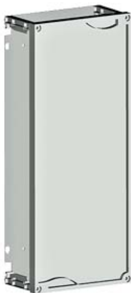
ALPHA 400/630 DIN, KIT MOUNTING PLATE WITH FIELD COVER WITHOUT CUTOUT H=300 W=250