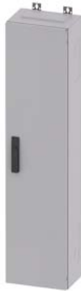
ALPHA 400 DIN, WALL-MOUNTING DISTRIBUTOR, EMPTY CUBICLE, AP-CUBICLE, RAL 9016, IP43, SK2 H=1250 W=300 D=210