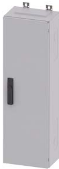
ALPHA 400 DIN, WALL-MOUNTING DISTRIBUTOR, AP-CUBICLE, RAL 9016, IP55, SK1, H=950 W=300 D=210