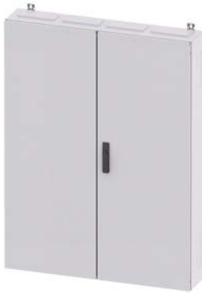
ALPHA 400 DIN, WALL-MOUNTING DISTRIBUTOR, DELIVERY FORM FLAT PACK, AP-CUBICLE, RAL 9016, IP43, SK2, H=1400 W=1050 D=210