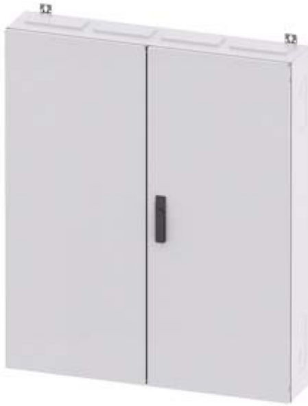
ALPHA 400 DIN, WALL-MOUNTING DISTRIBUTOR, DELIVERY FORM FLAT PACK, AP-CUBICLE, RAL 9016, IP43, SK2, H=1250 W=1050 D=210