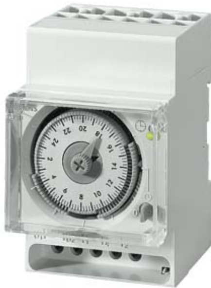
QUARTZ TIME SWITCH DAY FORM C 230V/50-60HZ 3 TE AUTOMATIC SU/WI TRANSFER