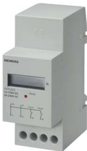
ELECTRONIC TIME COUNTER DC 12-150V, 24-240V, 50HZ ELECTRICAL A. MECHANICAL RESET