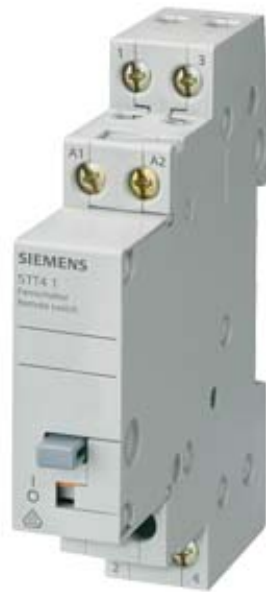
REMOTE SWITCH WITH 2 NO CONTACT FOR AC 230, 400V 16A CONTROL AC 12V