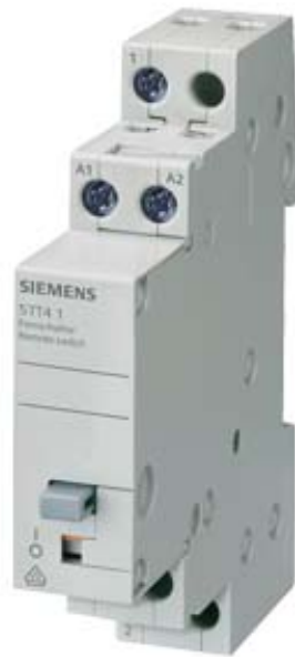
REMOTE SWITCH WITH 1 NO CONTACT FOR AC 230V 16A CONTROL AC 8V