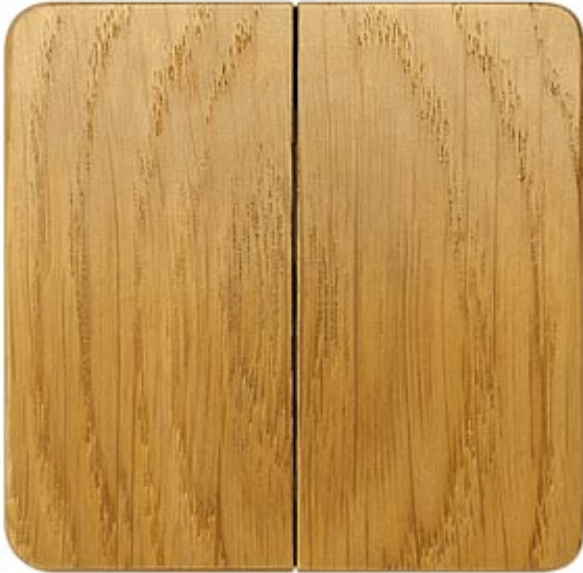
DELTA NATUR, LIGHT OAK ROCKER F.2-CIRCUIT/DUAL 2-WAY SWITCH F. DOUBLE PUSHB., 62X62MM