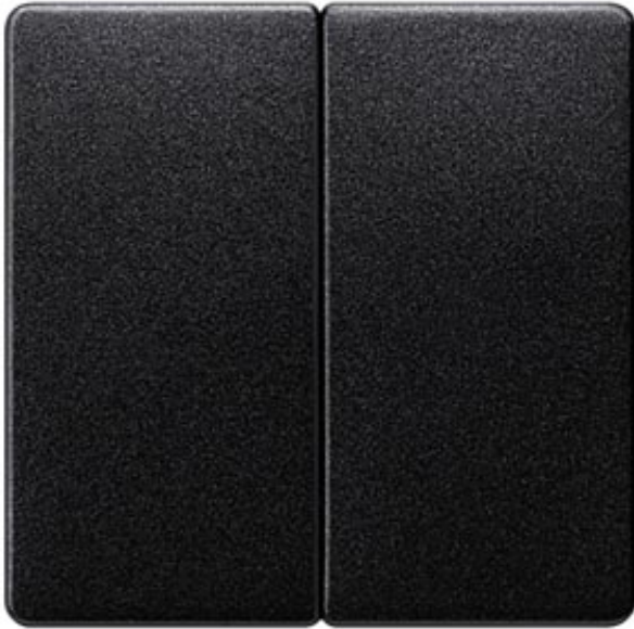
I-SYSTEM, CARBON METALLIC ROCKER F.2-CIRCUIT/DUAL 2-WAY SWITCH F. DOUBLE PUSHB., 55X55MM