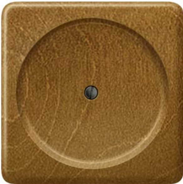
DELTA NATUR, CHERRY BLANKING PLATE, 62X62MM