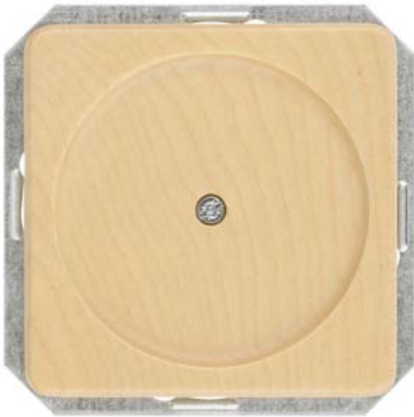
DELTA NATUR, MAPLE BLANKING PLATE, 62X62MM