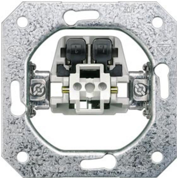
DELTA SWITCH INSERT FM OFF SWITCH 1POLE 10A 250V