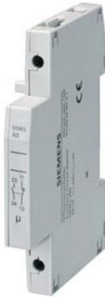
AUXILIARY SWITCH ATTACHABLE F. RES.CURRENT OP.CIRC. BREAKER F. 100+125A, 1NO+1NC