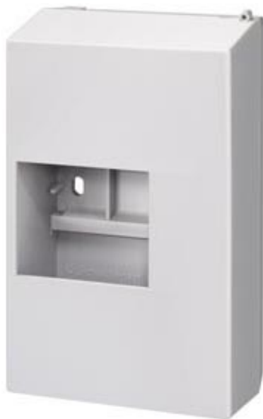
TERMINAL COVER, GRAY IP40, F. SURFACE MOUNTING F.BUILT-IN DEVICES MAX. 4.5MW