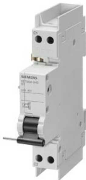
SHUNT RELEASE MOUNT. AC110-415V,F. LS-SWITCH T=70MM