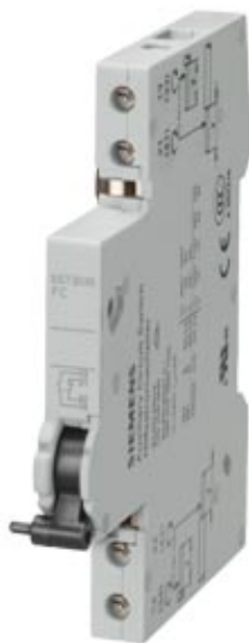
FAULT SIGNALL. SWICHT MOUNT. 2S, F. LS-SWITCH T=70MM