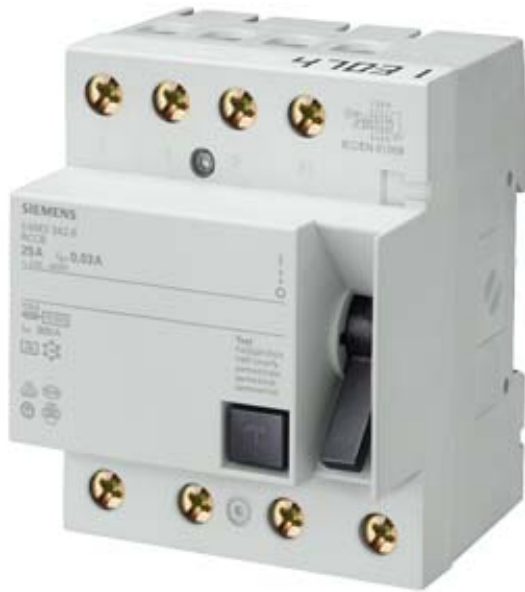
RES.CURRENT OP.CIRCUIT BREAKER TYPE A PSE/SSF 25A 3+N-POL IFN 300MA 400V 4MW