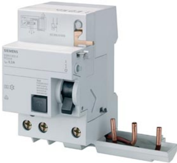
Similar to image

RC UNIT FOR MCB 5SY TYPE A (PSE/SSF), D=70MM 0.3-63A 3POLE IFN 0.3A 400V FOR SELECTIVE SWITCH OFF