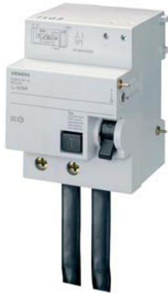
RC UNIT F. MCB 5SX6+7 IMP WITHST STRGTH/SURGE STRGTH 80/100A 2POLE IFN 30MA 230V